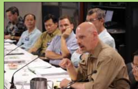
(Above) Workshop participants debate the impact of global trends.