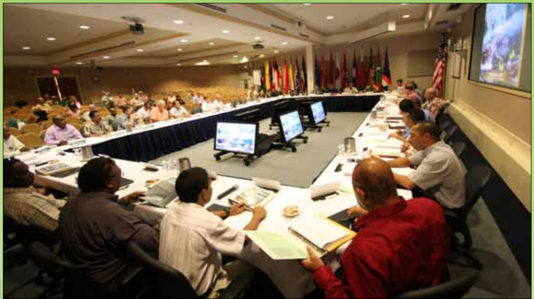
Another workshop in the Pacific Islands security series is tentatively scheduled for September 2012.

As a group they developed recommendations for next steps that regional govern-