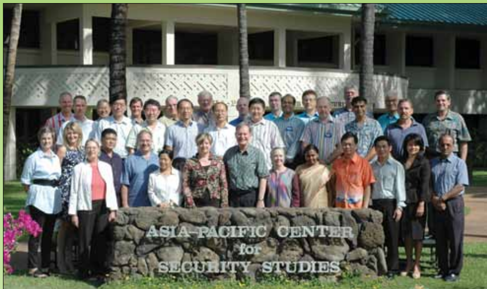
Science & Technology workshop attendees looked at gaps between S&T and security communities.