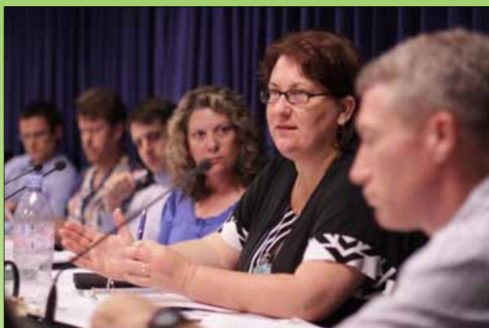
“Leveraging Security Cooperation Education and Maximizing the Alumni Network” workshop attendees participate in a plenary session in the Center Conference Room May 13.