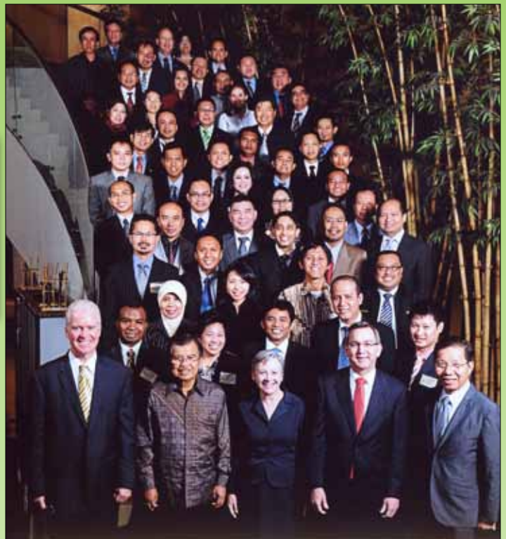
Members of the media, government spokesmen and crisis management specialists came together in Jakarta to look for ways to improve communications during a crisis.