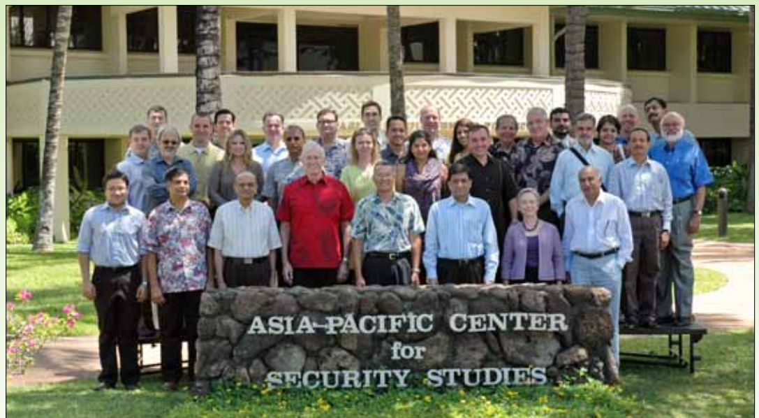
The workshop was attended by more than 25 participants representing sectors such as security, diplomacy, academics and the media.