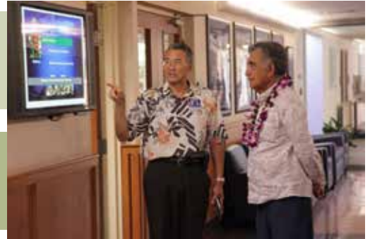
(Right) The President of French Polynesia visited the center for a roundtable on Oceania security.