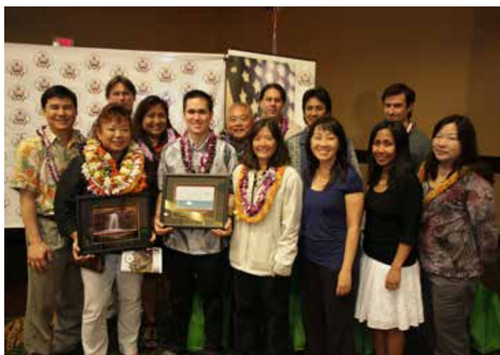
APCSS employees who were recognized at the Honolulu-Pacific Federal Executive Board's Excellence in Federal Government Awards pose for a group photo.