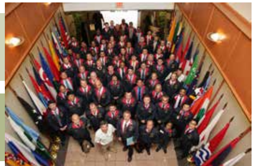
(Right) International Fellows from the National Defense University tour the center.