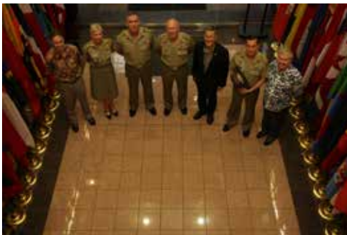
(Left) General Hurley (SEC04-2) visited to discuss how the Australian Defence Organization and APCSS can strengthen their relationship.