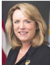
Ms. Deborah Lee James

Secretary of the Air Force Deborah Lee James addressed U.S. and international Fellows Oct. 14 at the Daniel K. Inouye Asia-Pacific Center for Security Studies.