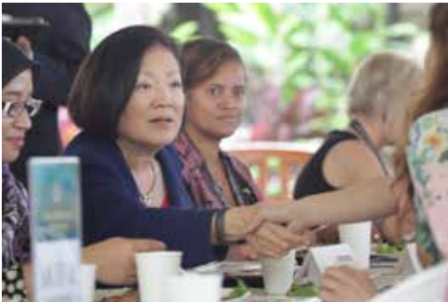
(Left) Senator Mazie Hirono visited APCSS Apr. 5 for an orientation and had lunch with ASC 13-1 Fellows on the lanai.