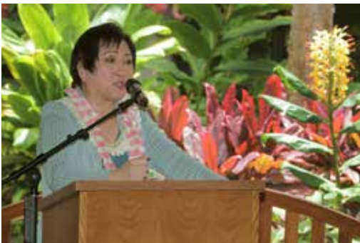
(Left) Rep. Colleen Hanabusa spoke to Fellows of ASC 13-1 during a “Whole of Society” panel Apr. 29 on the APCSS lanai.