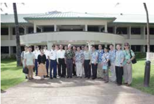
(Left) A Taiwan delegation visited APCSS April 22 for an overview of the Center's mission, goals, and security education opportunities