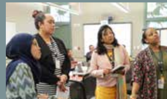
Europe-Asia CT: Securing Borders May 14 - 16