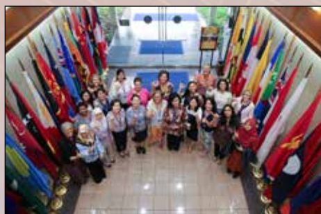
CHOD Spouses pose for a group photo with DKI APCSS leadership and faculty in the foyer.