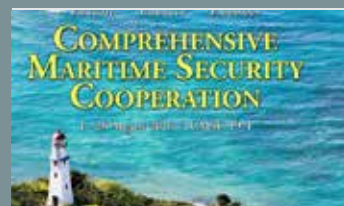
Comprehensive Maritime Security Cooperation Course (CMSC 19-1) New Course Begins Aug. 1 - 28