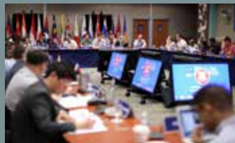
14th ADMM+ EWG HADR Mar. 18 - 22