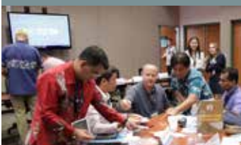
Transnational Security Cooperation Course (TSC 19-1) May 19 - May 24