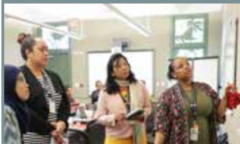
Comprehensive Crisis Management Course (CCM19-1) Feb. 7 - Mar. 15