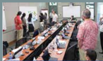
Advanced Security Cooperation Course (ASC 19-2) Sept. 19 - Oct. 23

To see the latest updates and most current scheduling information, go to our public website at: https://apcss.org/event/