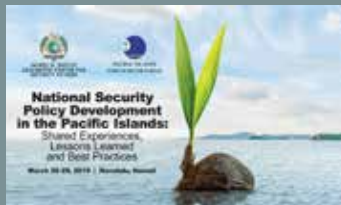
Nat. Security Policy Development in the Pac. Islands: Shared Experiences, Lessons Learned, and Best Practices March 27 - 29