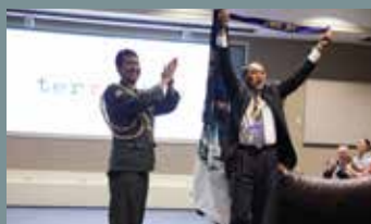
Comprehensive Security Responses to Terrorism Course (CSRT19-1) June 6 - July 3