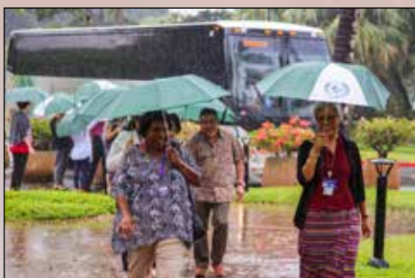
20 Chief of Defense (CHOD) Spouses participated in a seminar session here at the Daniel K. Inouye Asia-Pacific Center for Security Studies on Wednesday, Sept. 12, 2018.