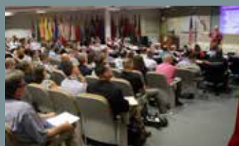
Asia-Pacific Orientation Course (APOC19-1) July 15 - 19