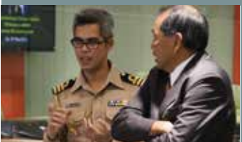
Alumni Association Workshop Sept. 10 - 12